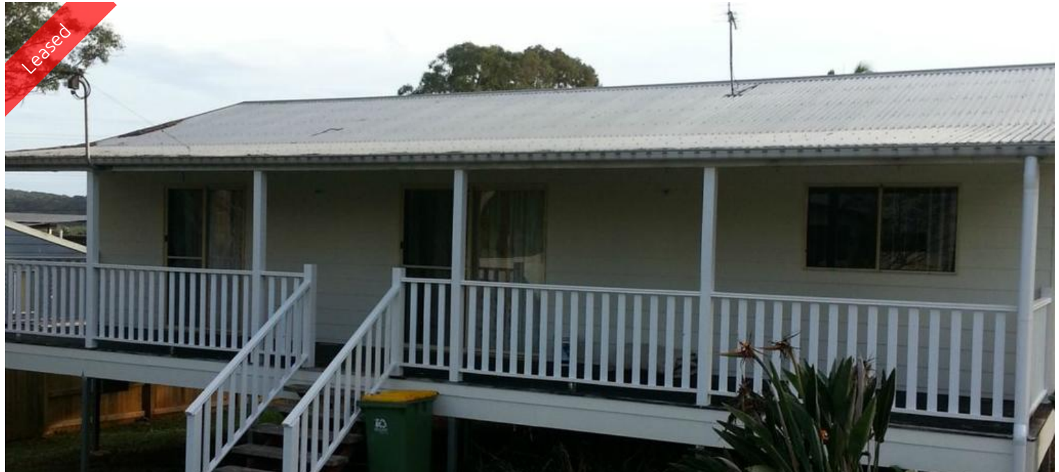
24 Patterson Street, Russell Island