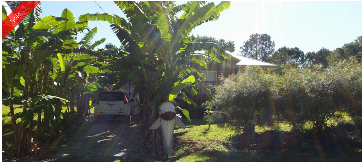
41 Taylor Street, Russell Island