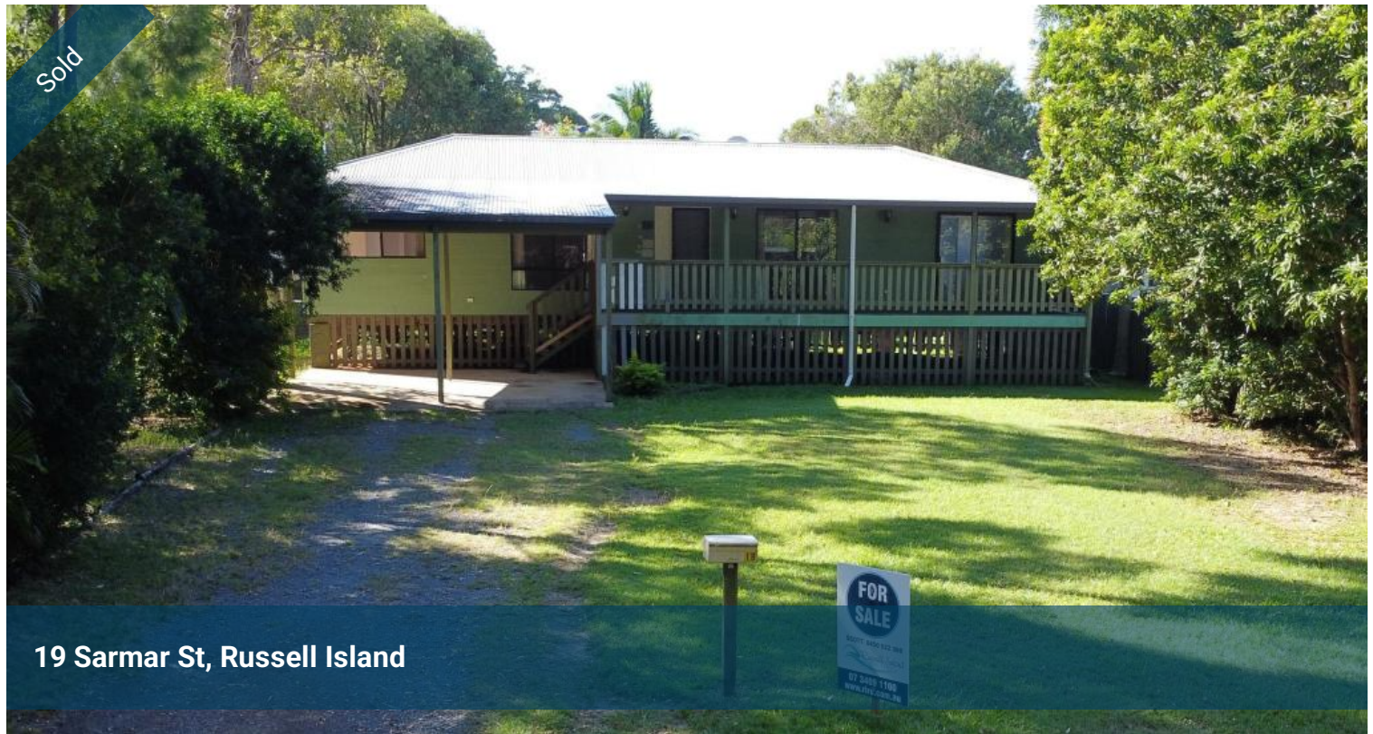
19 Sarmar St, Russell Island