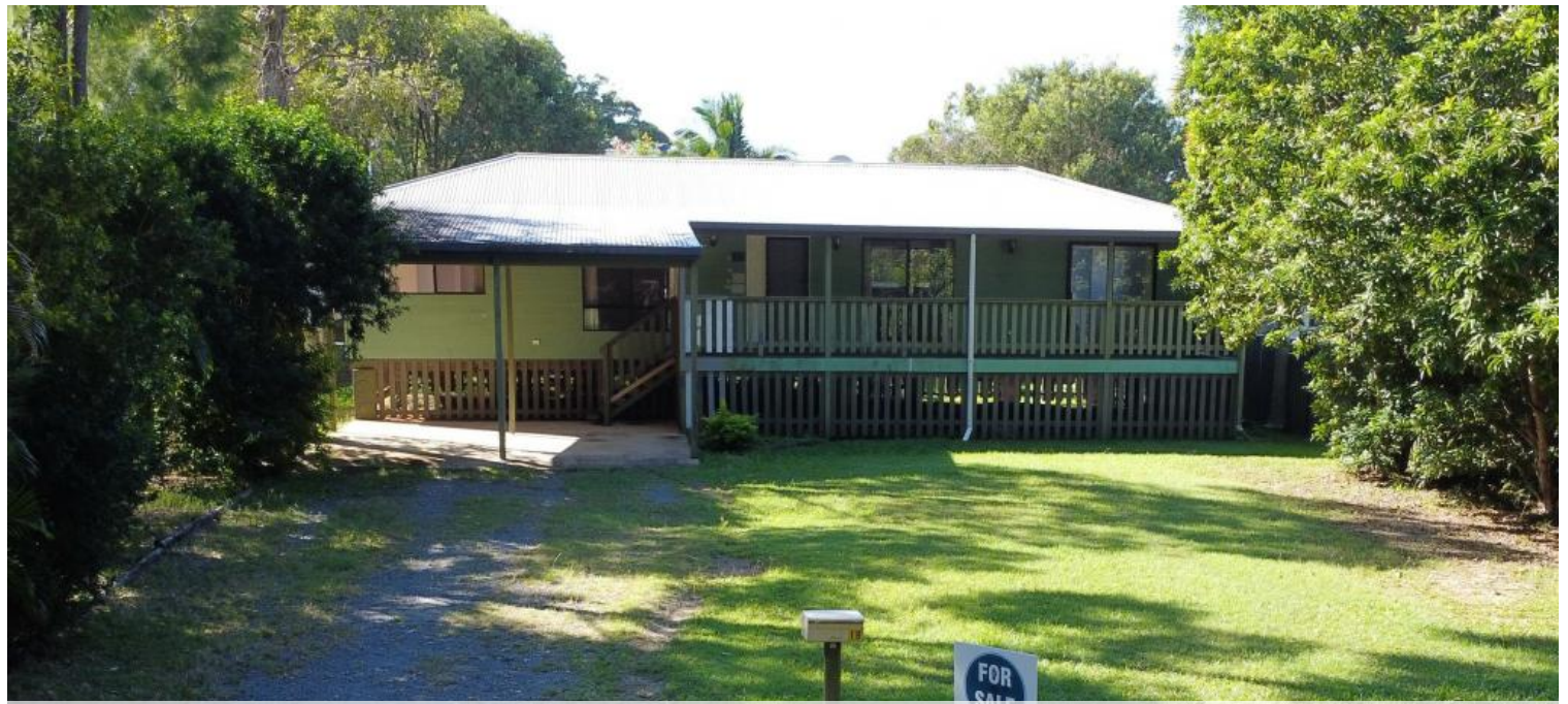
19 Sarmar St, Russell Island