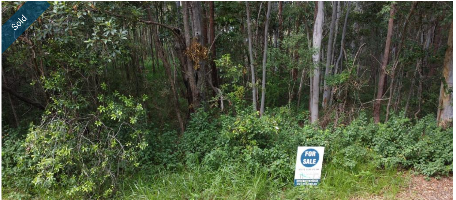
12 Murray Crescent, Russell Island