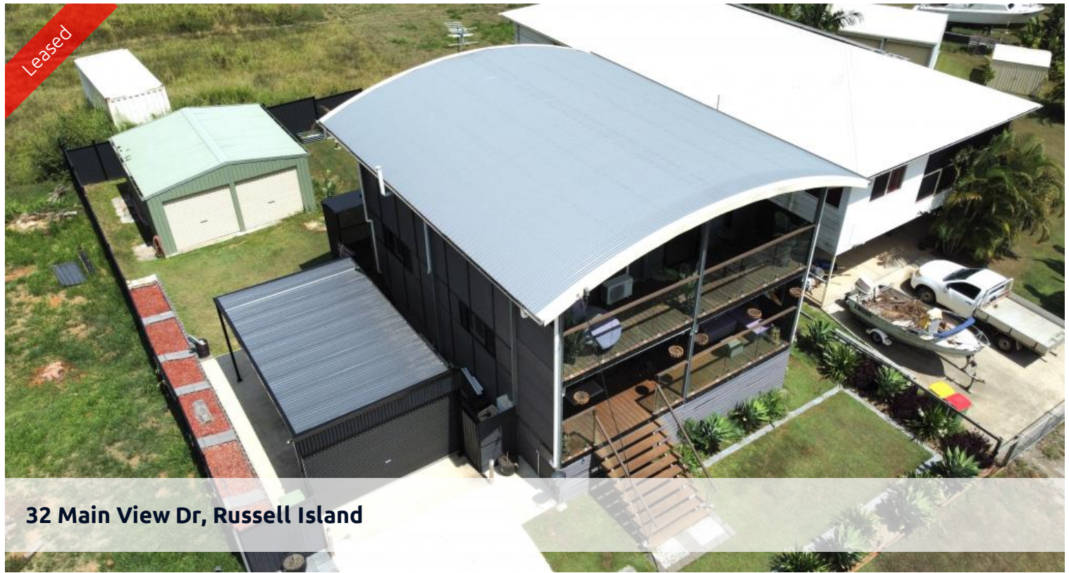
32 Main View Dr, Russell Island