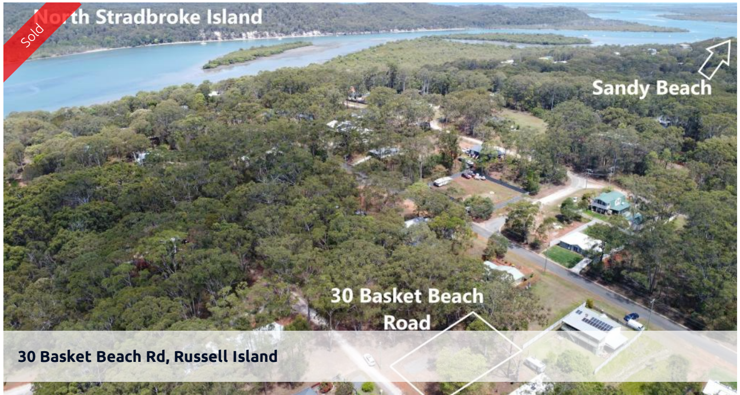
30 Basket Beach Rd, Russell Island