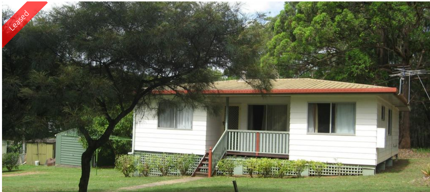
4 Sundown Street, Russell Island