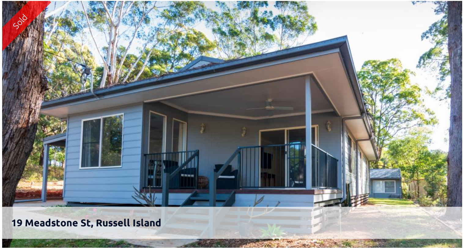
19 Meadstone St, Russell Island