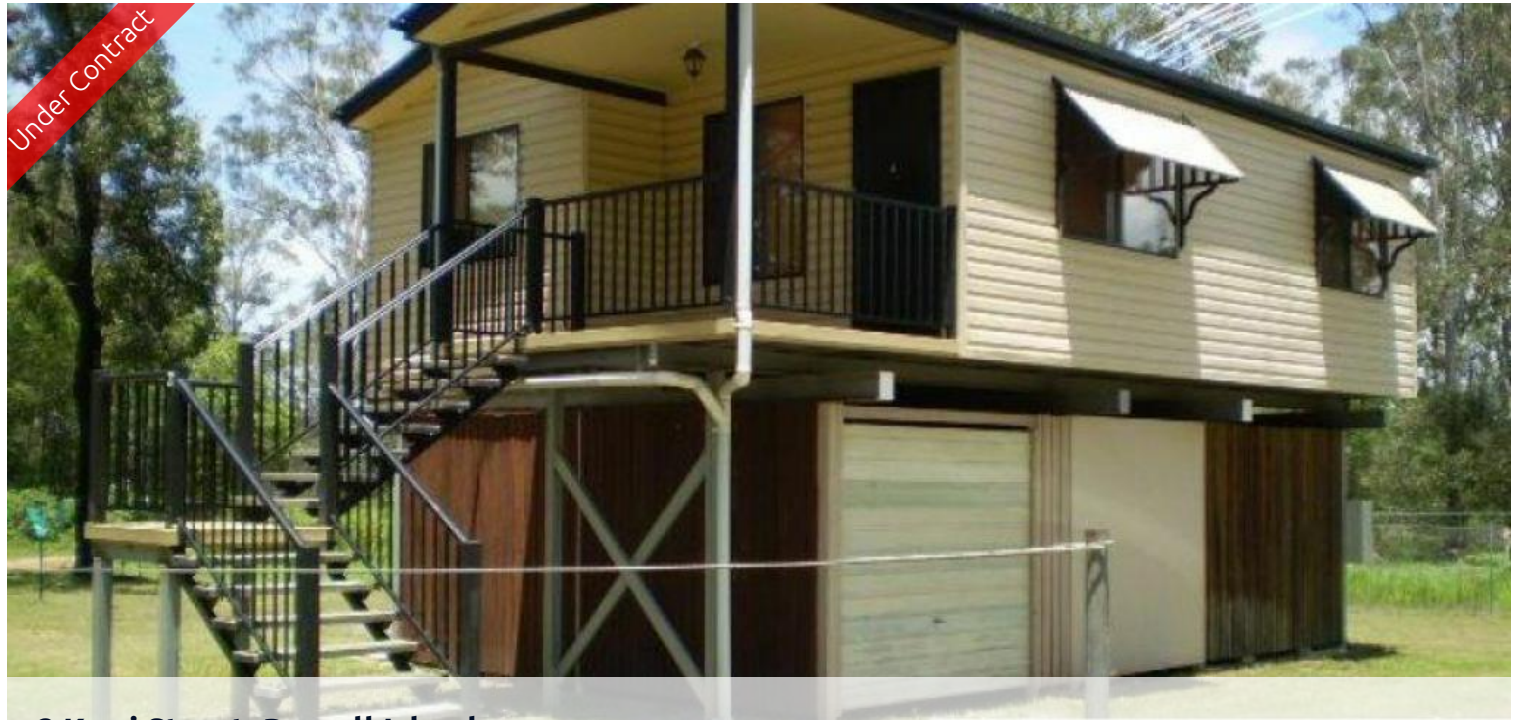
2 Karri Street, Russell Island