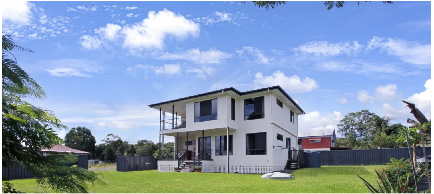
20 Mark Rd, Russell Island