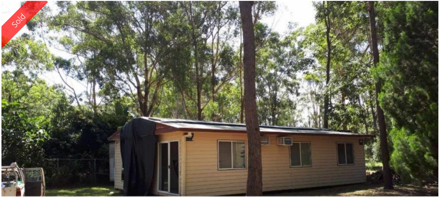
14 Main View Dr, Russell Island