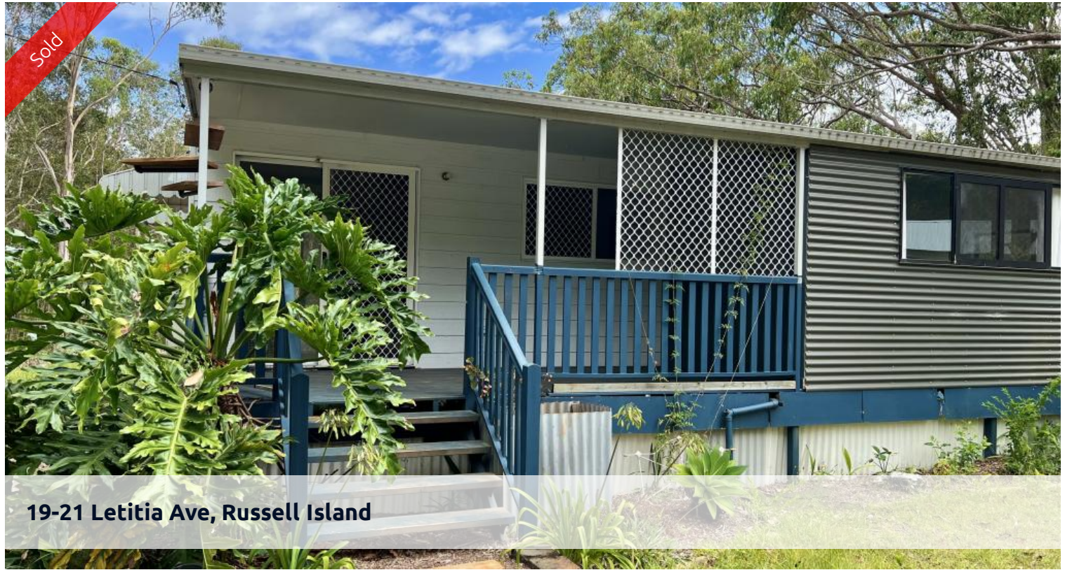
19-21 Letitia Ave, Russell Island