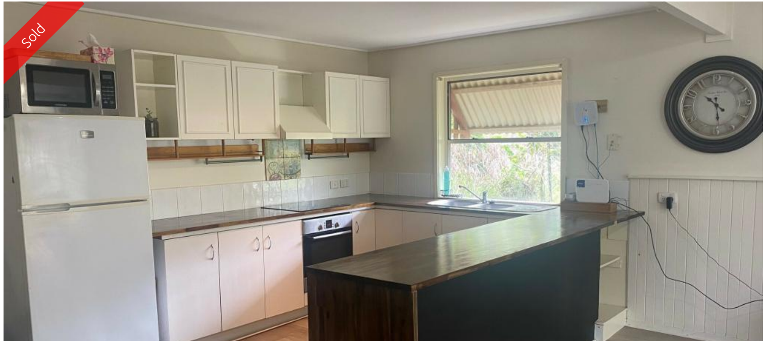
8 Catamaran St, Russell Island