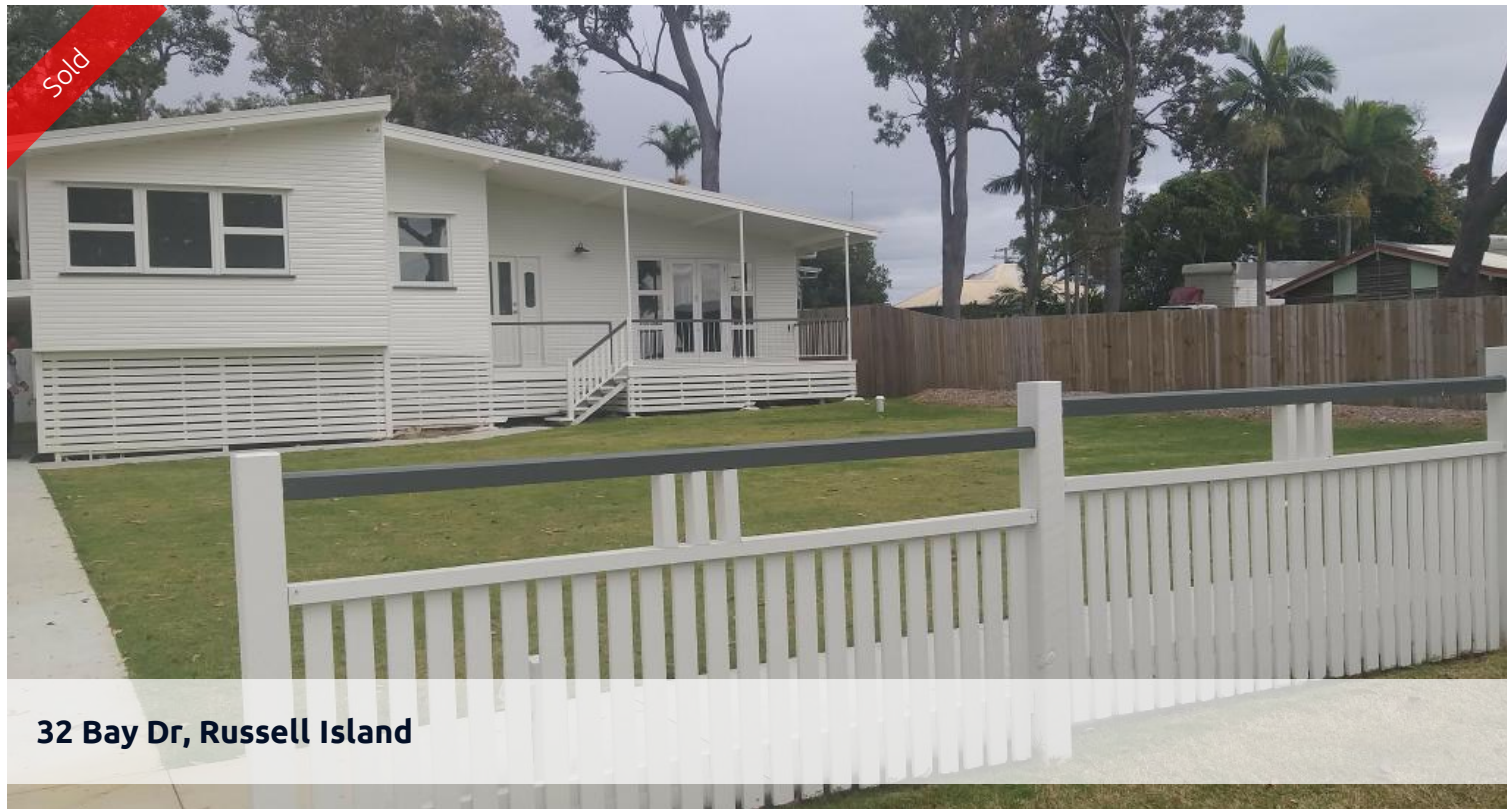
32 Bay Dr, Russell Island