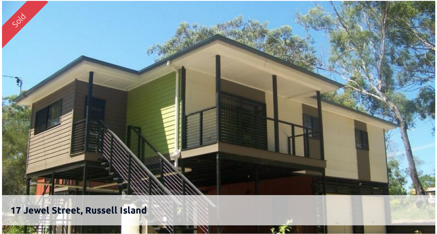
17 Jewel Street, Russell Island