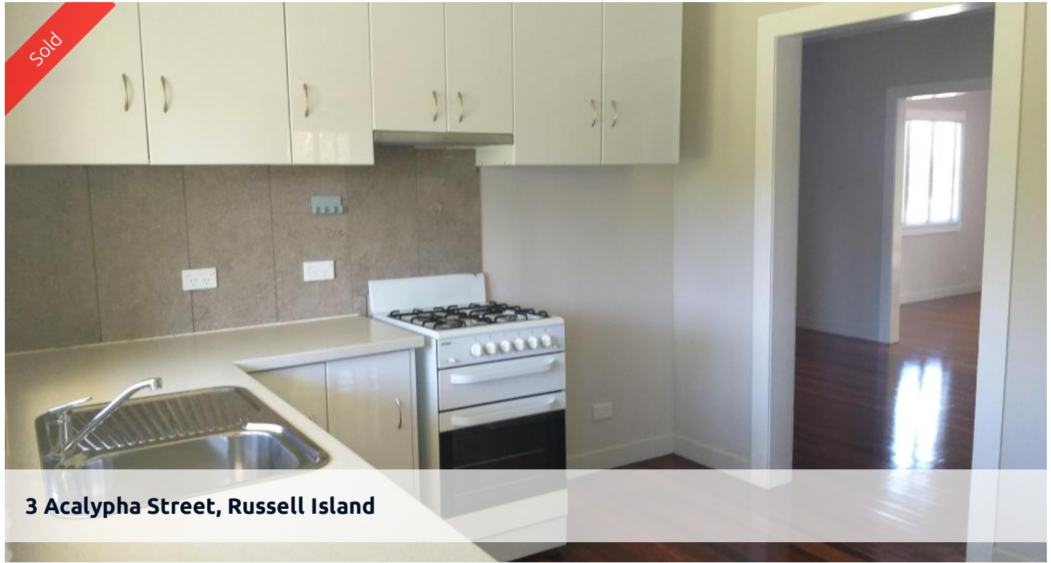
3 Acalypha Street, Russell Island