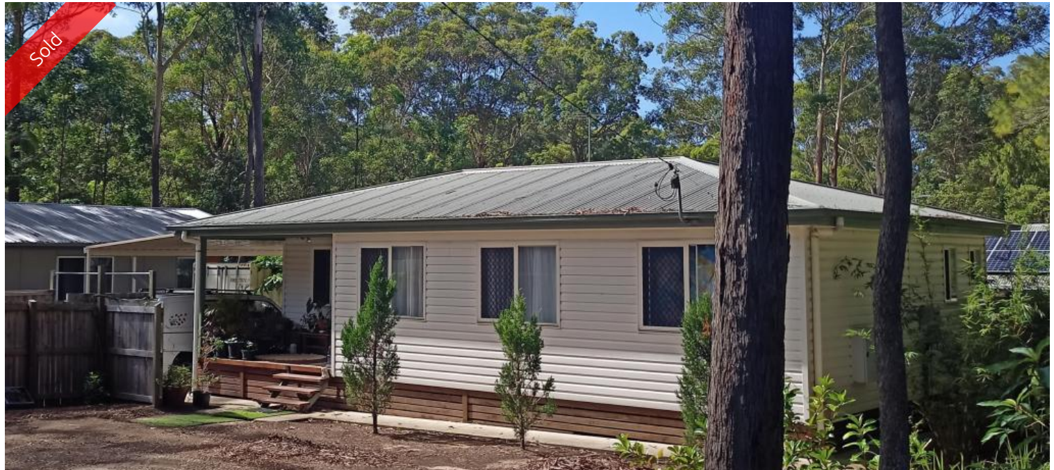
12 Angorra St, Russell Island