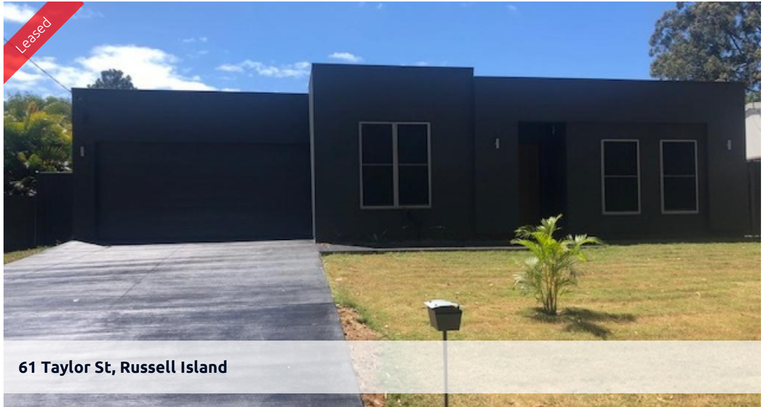
61 Taylor St, Russell Island