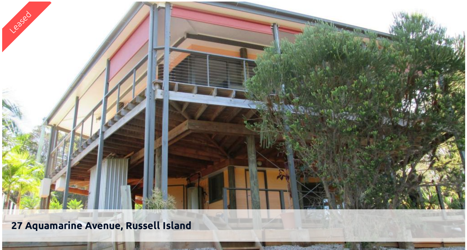
27 Aquamarine Avenue, Russell Island