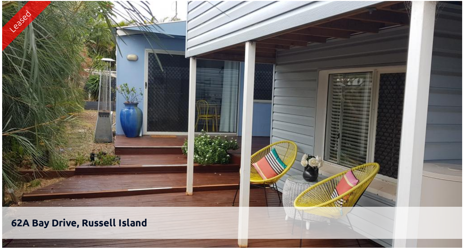
62A Bay Drive, Russell Island