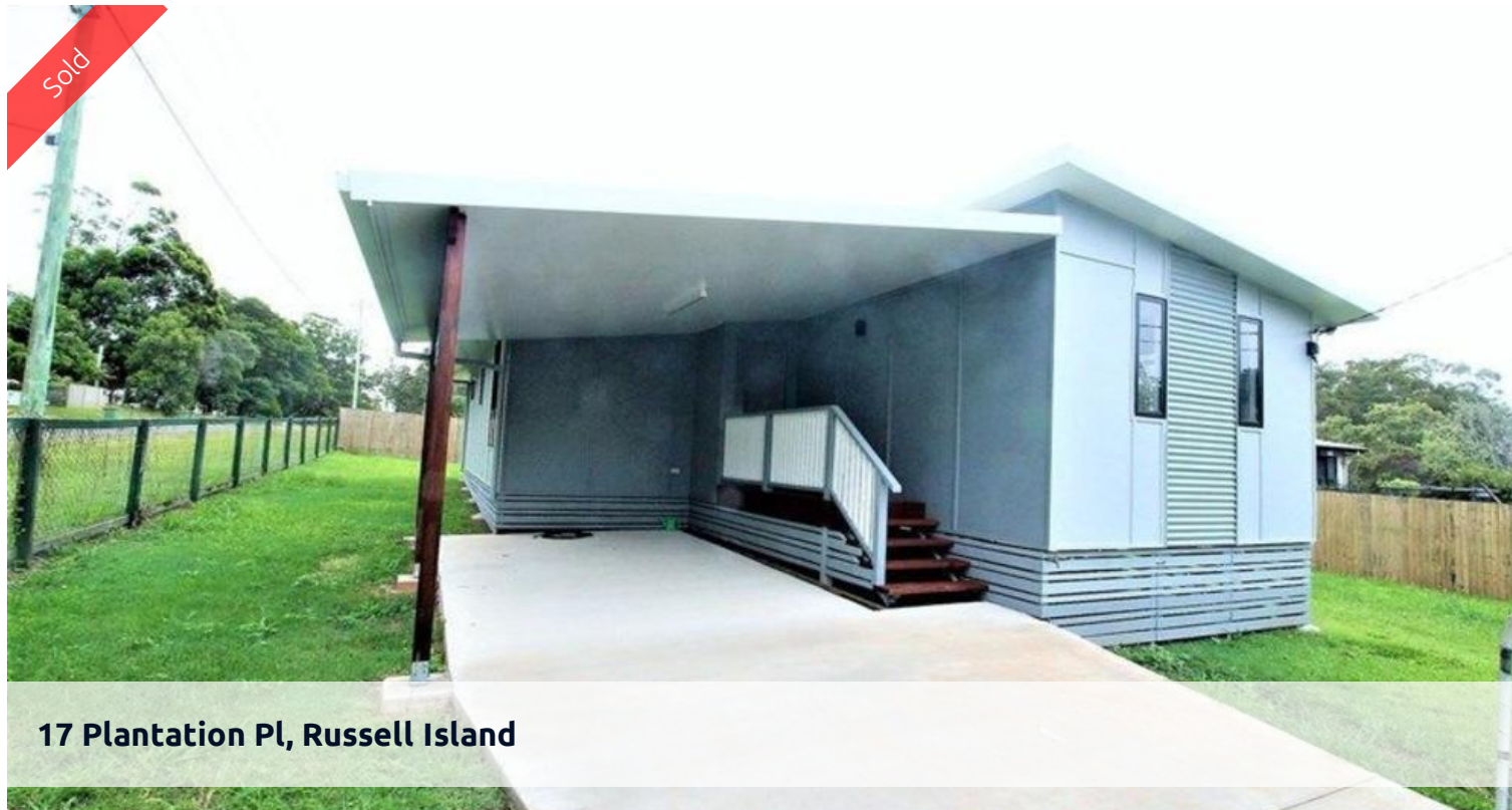
17 Plantation Pl, Russell Island