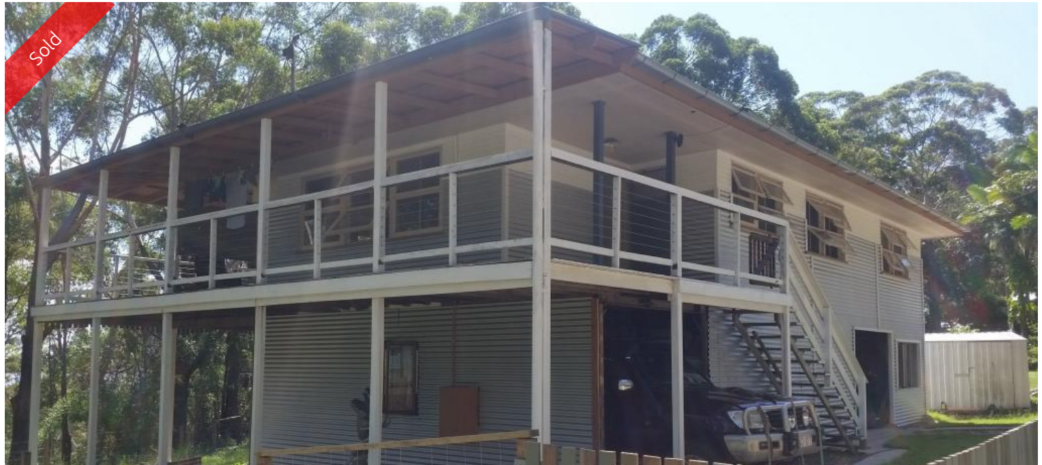
50 Deenya Pde, Russell Island