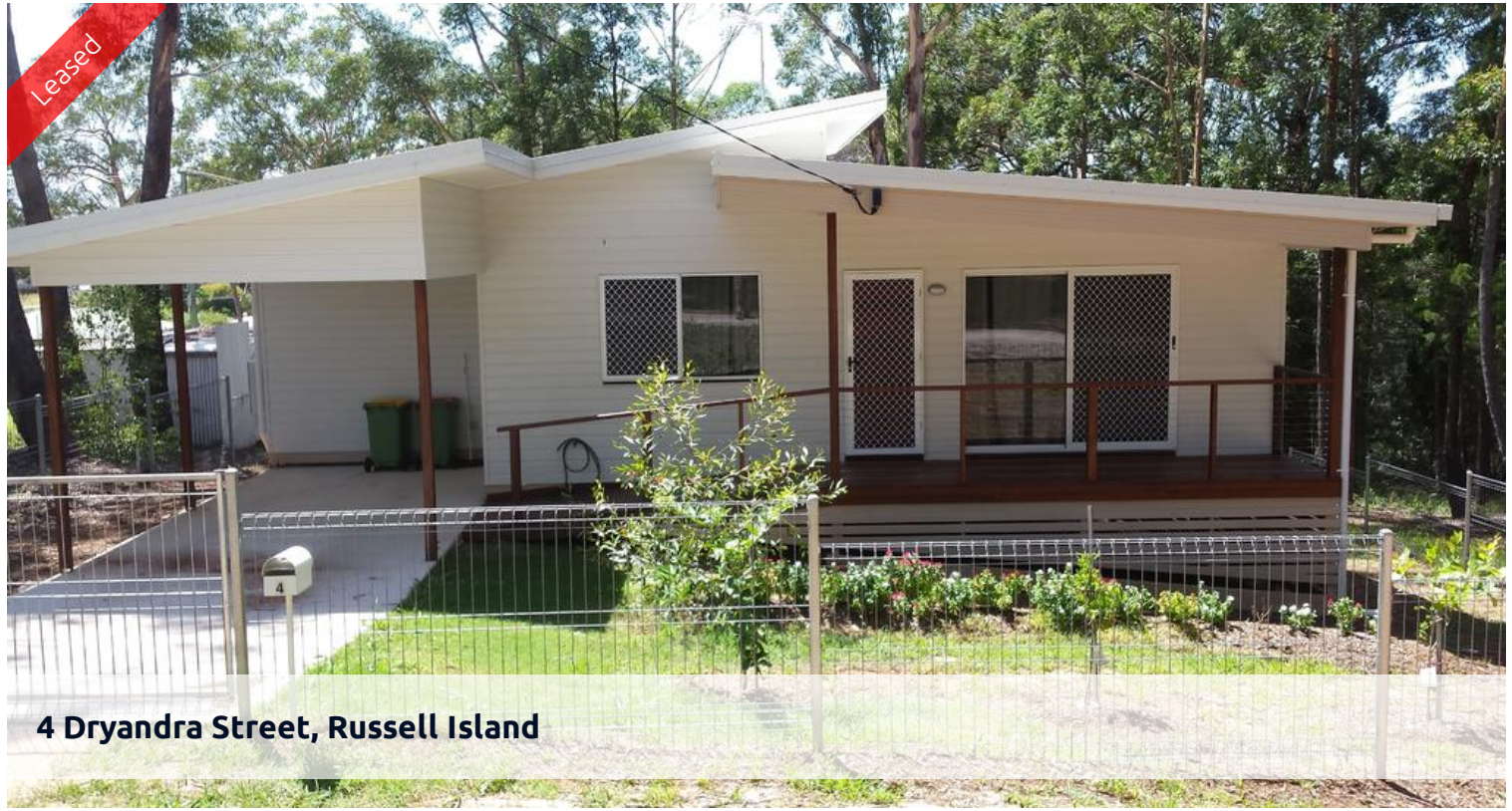
4 Dryandra Street, Russell Island