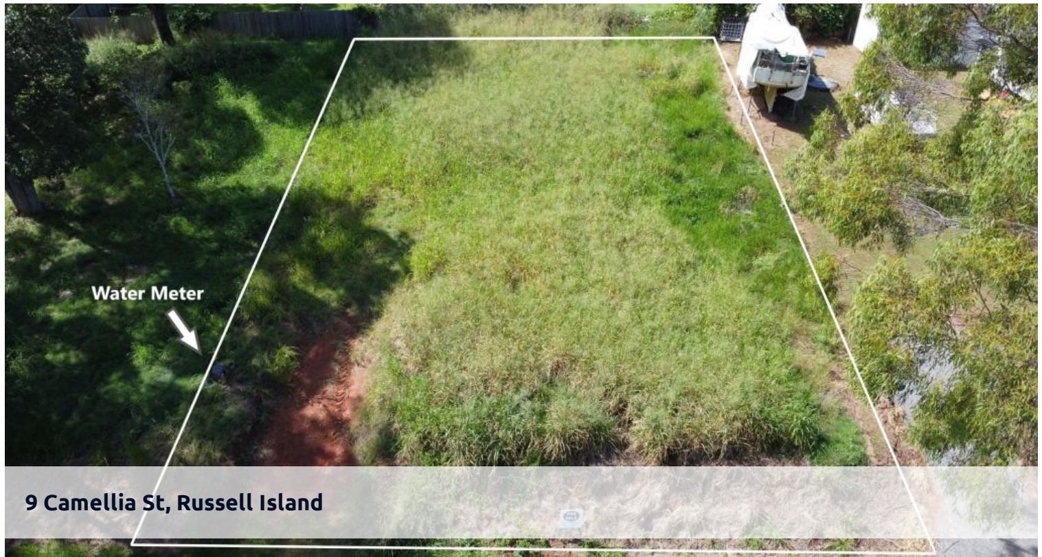
9 Camellia St, Russell Island