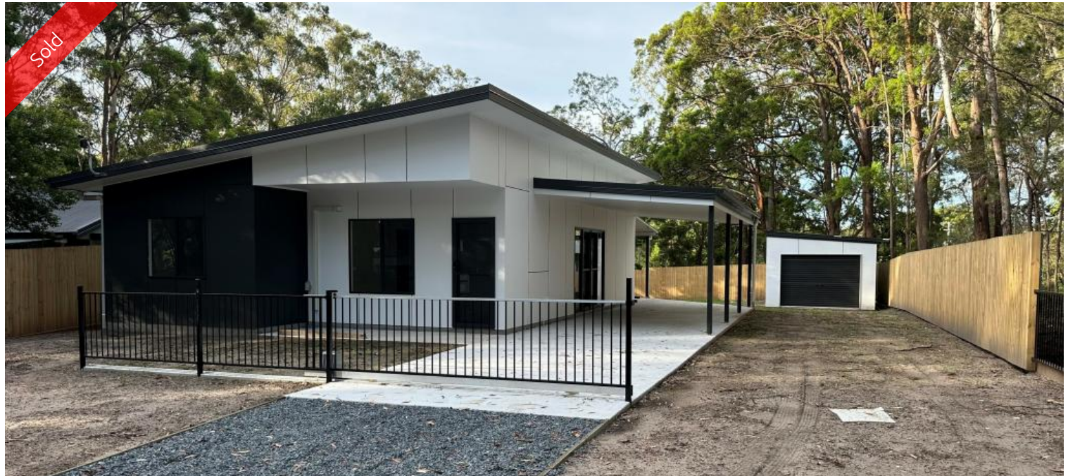
19 Little Cove Rd, Russell Island