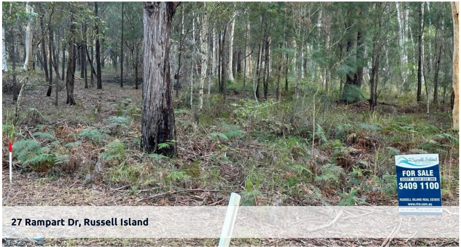
27 Rampart Dr, Russell Island