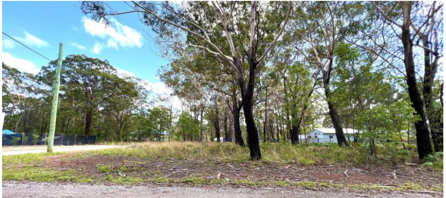
39 Hemp Hill Rd, Russell Island