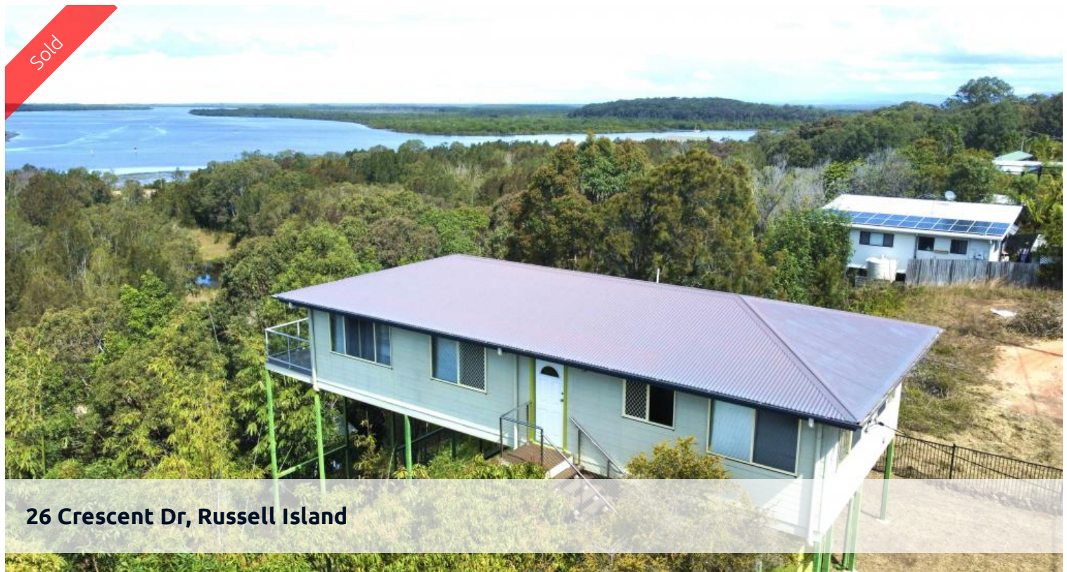
26 Crescent Dr, Russell Island