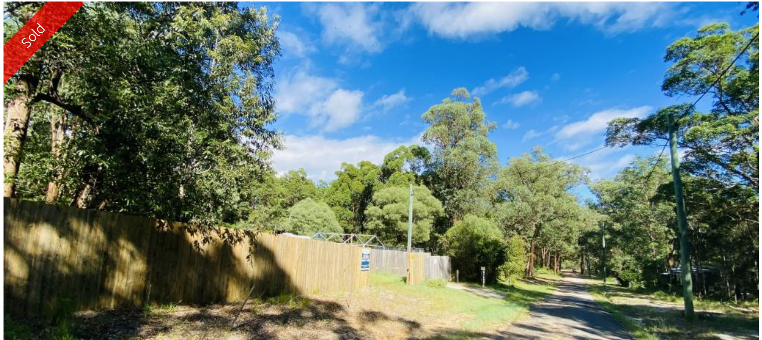
22-24 Cook Ave, Russell Island