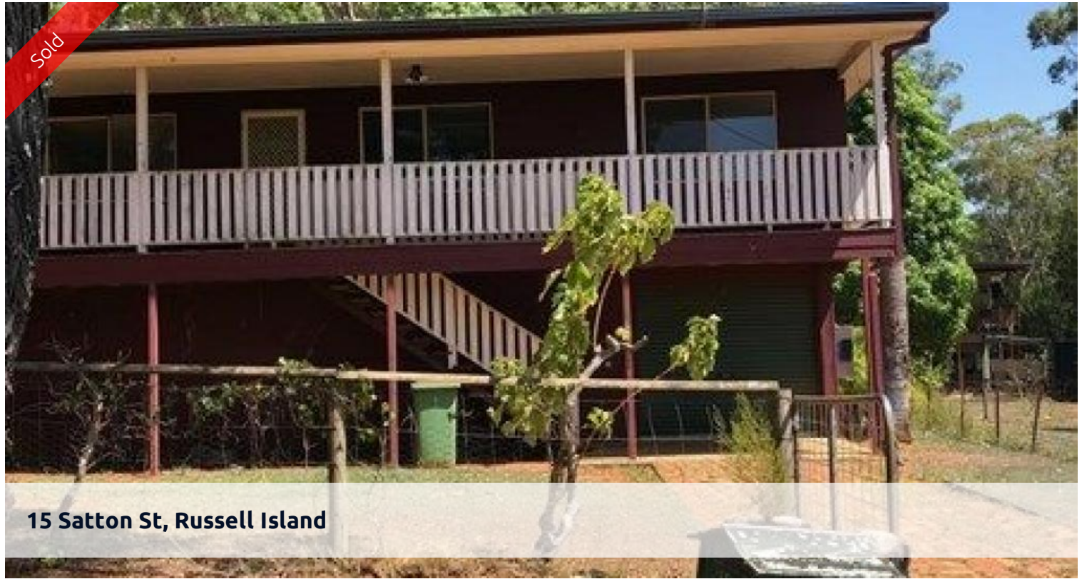
15 Satton St, Russell Island