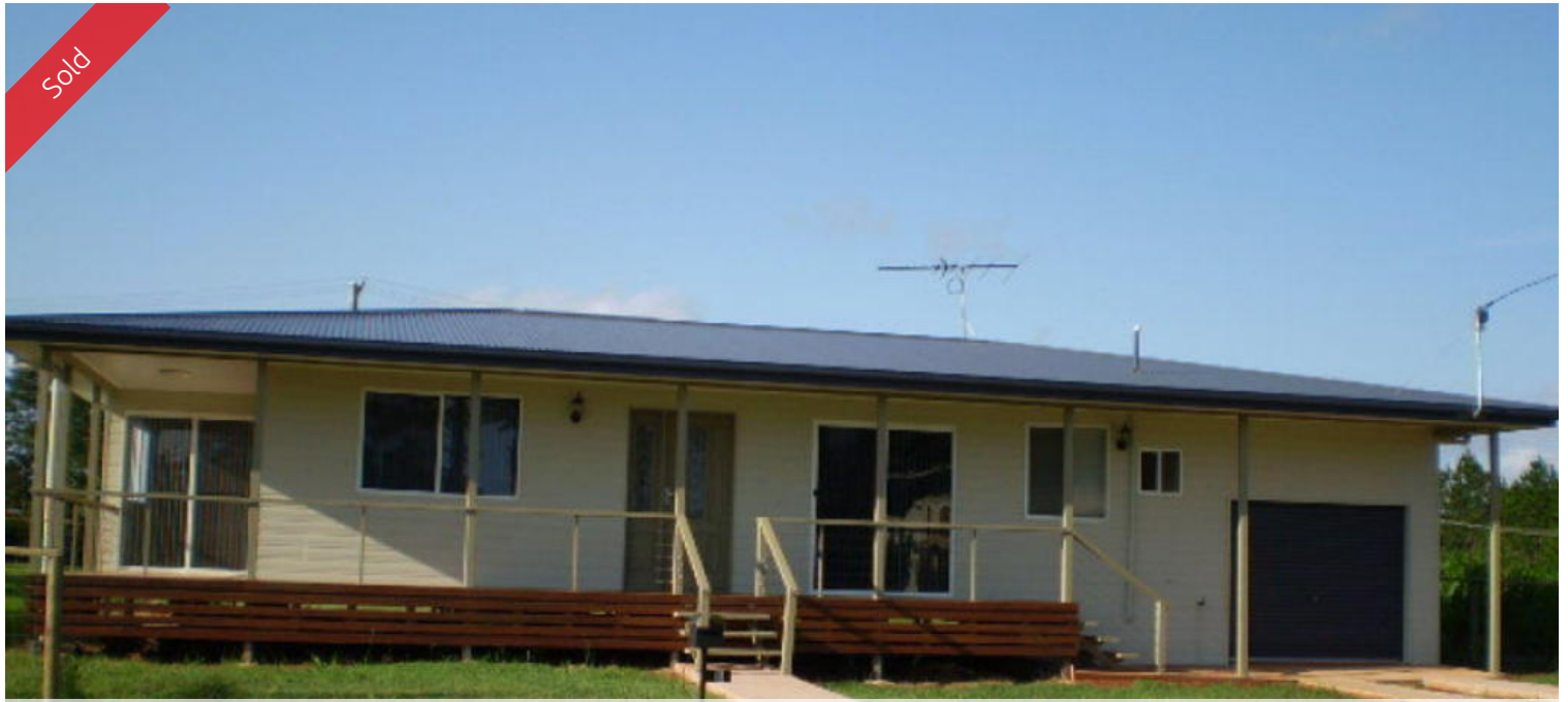
3 Grevillea Street, Russell Island