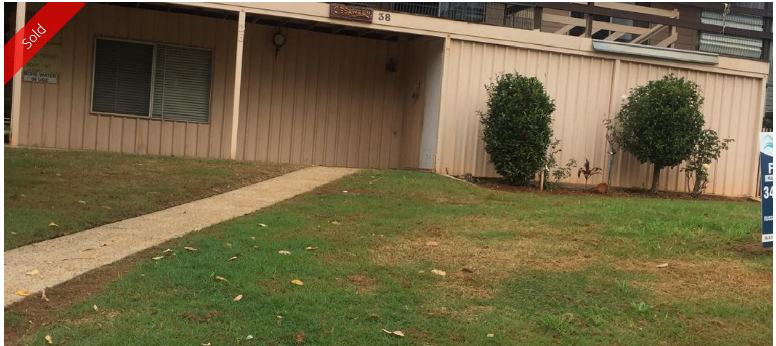
38 Cavendish St, Russell Island